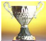
Table Topics and Humorous Contest

Table Topics and Humorous Contests will be held in August this year. Now, is the time to improve and perfect your impromptu speaking. Pick a few books about how to get started writing your comedy or humorous speech to enter the humorous speech contest. Winners of both contests will represent the club in the Area Contest held in October 2007.